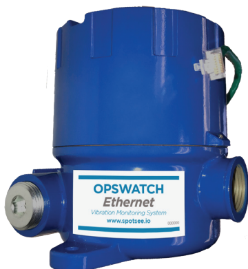
OpsWatch - Ethernet