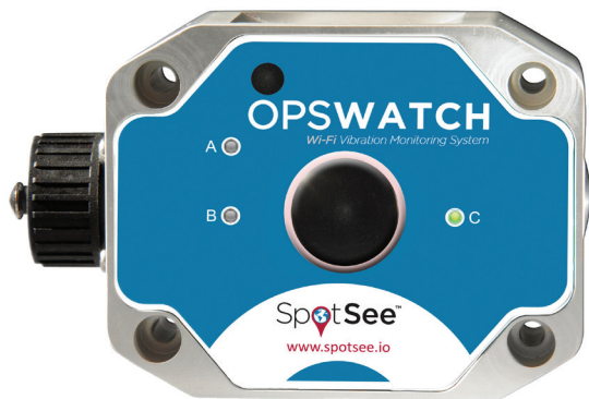
OpsWatch - WiFi

The OpsWatch monitoring system makes it simple to identify changes in vibration and see unexpected impact events. The rich data made available by the continuous monitoring, allows your engineering and maintenance teams to develop customized alarm levels for each piece of monitored equipment and develop triggers for predictive maintenance routines. The results are increased up-time, extended service life, reduced maintenance costs of mission critical equipment and fewer catastrophic failures.